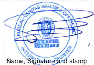
Name, Signature and stamp

Completed at: Ymuiden on: 28 January 2020 by: Balbes