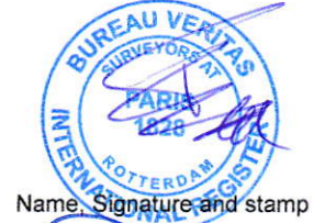
Name, Signature and stamp

Completed at: Ymuiden on: 20/11/2018 by: T. van de Nes